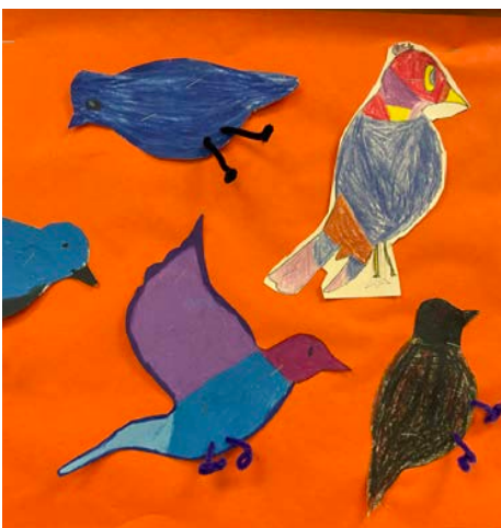
Birds by 3rd 4th and 5th graders